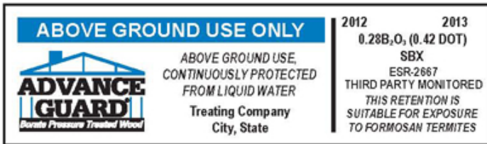
FIGURE 1—TYPICAL ADVANCE GUARD® BRAND BORATE PRESSURE TREATED STAMP DESIGN (0.42 DOT)