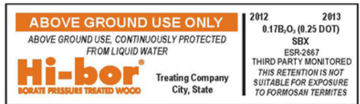
FIGURE 4—TYPICAL HI-BOR® BRAND BORATE PRESSURE TREATED STAMP DESIGN (0.25 DOT)