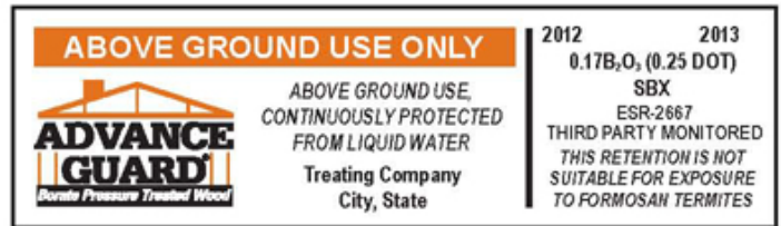
FIGURE 2—TYPICAL ADVANCE GUARD® BRAND BORATE PRESSURE TREATED STAMP DESIGN (0.25 DOT)