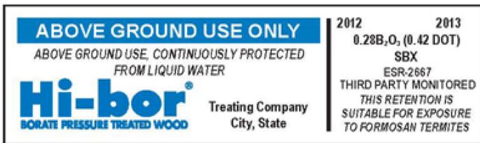
FIGURE 3—TYPICAL HI-BOR® BRAND BORATE PRESSURE TREATED STAMP DESIGN (0.42 DOT)